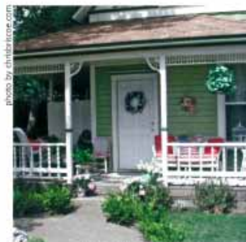
A treat is to stroll the neighborhoods, delighting in the numerous framed houses with their porches and pretty gardens.