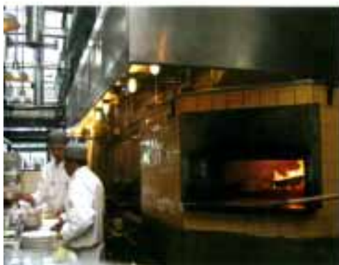
Things get busy at the Standing Stone Brewing Company—one of many popular eateries.

At Alex's Restaurant and Bar at 35 Main, you can sit by the fireside, mull over a glass of wine and contemplate, well into the night, the production you just saw. At Thai Pepper , you can eat in style on the patio that is literally in the creek bed. Hungry but don't want to take time for breakfast? Stop at the Village Bakery , or The Apple Cellar , for fresh-baked pastries. If omelets are your thing, Munchies on the plaza has them in every variety all day long. What about a gooey, hot fudge sundae like they served in the 1920s? Head for Lithia Fountain & Grill , where they also serve up comedy Monday nights. continued >