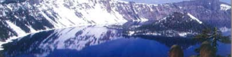
Crater Lake National Park

In Southern Oregon you don't have to choose.