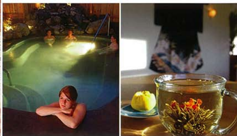
Left to Right: Alchemy Botanicals, Chozu Bath and Tea Gardens

to book in advance. 541-552-0202, www.chozugardens.com