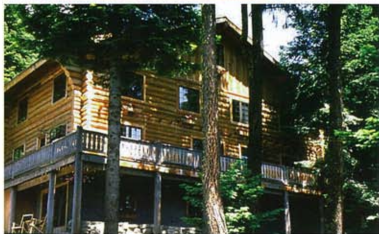
Above: Ashland Springs Hotel, Mt. Ashland Inn and B&B

geous acres near Mount Ashland ski area, the log-home style lodging was handcrafted from the property’s incense cedar trees and has five cozy guest suites (many of which feature beautifully crafted beds by Laurel’s multi-talented husband, Chuck). I stayed on the top floor in the Sky Lakes Wilderness Suite with majestic views of Mt. Shasta. The very cozy suite had a Jacuzzi tub for two, a river rock fireplace and big comfy bed with a handmade quilt and down comforter among other welcoming details. Not to be missed: the fabulous organic breakfast, served by the course (loved the fresh fruit smoothie and homemade blueberry jam). 541-482-8707, www.mtashlandinn.com