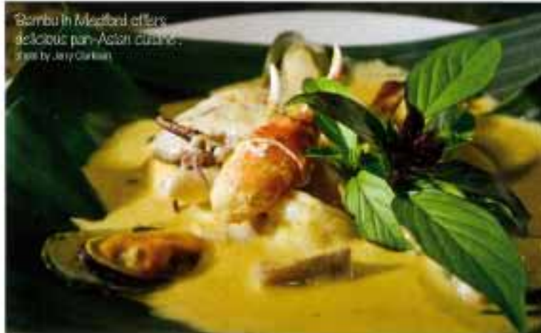
Bambu in Medford offers delicious pan-Asian cuisine.