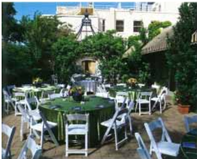
The English Garden at Ashland Springs Hotel.

rolling hills that surround the town. But even Mother Nature needs help planning a wedding. Enter the Springs' expert staff of wedding professionals (DuQueene was even featured on television's Platinum Weddings ) for a carefree day that comes together, well, naturally.