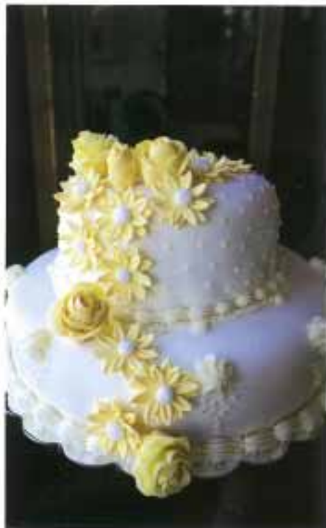
Apple Cellar Bakery's cakes are as delicious as they are beautiful.

and everything a bride could need for her wedding, from linens to lingerie, it's hard to believe that Your Wedding Connection could also contain a standout selection of hard-to-find wedding dresses. Brides are invited to try on as many dresses as they'd like while working with the Connection's experienced consultants. The best part? If a bride finds a gown she likes and it fits her, there's no need to wait for a special order (de rigueur in most other shops)—the Connection will sell the dress off the rack.