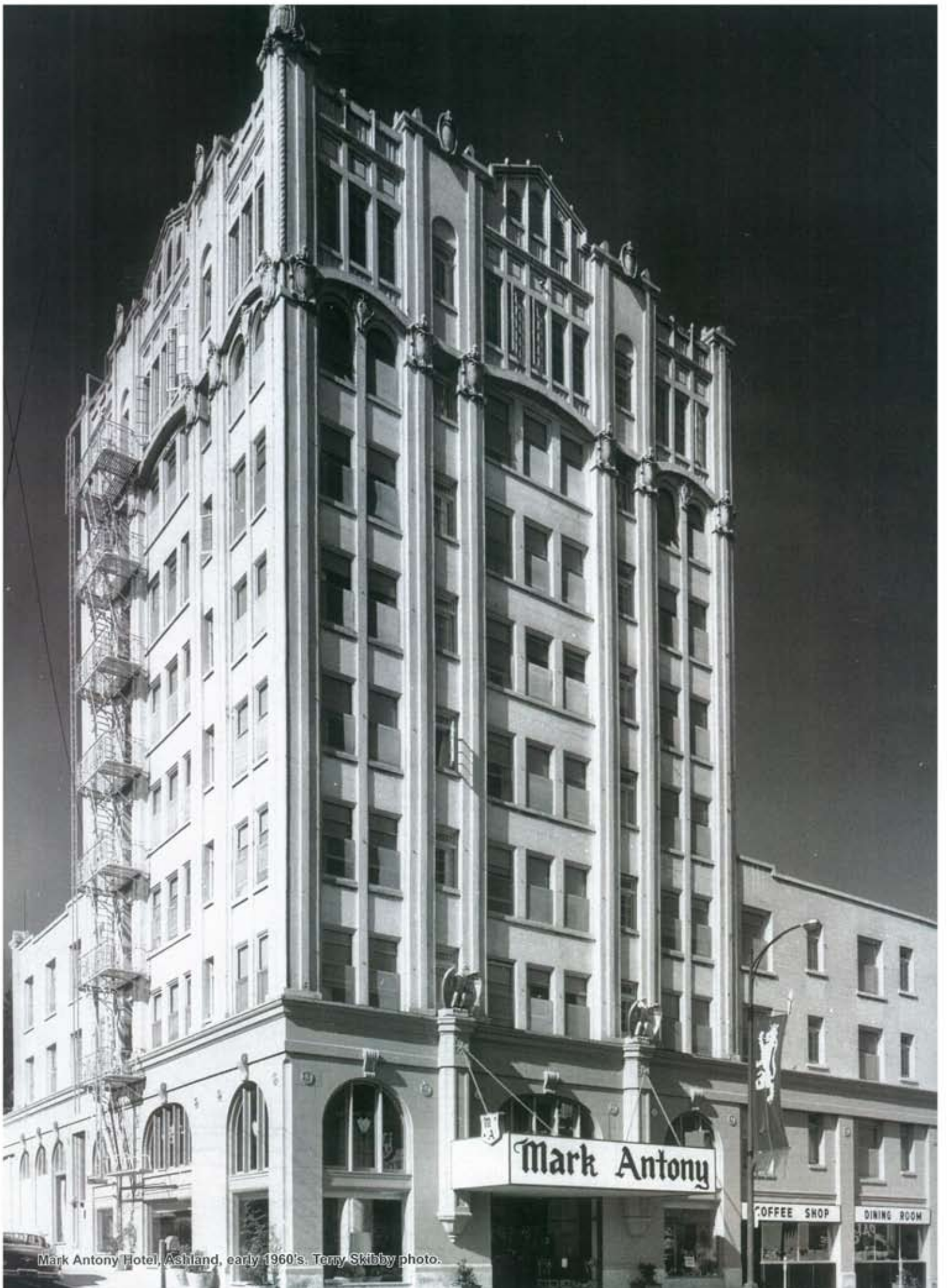
Mark Antony Hotel, Ashland, early 1960's.