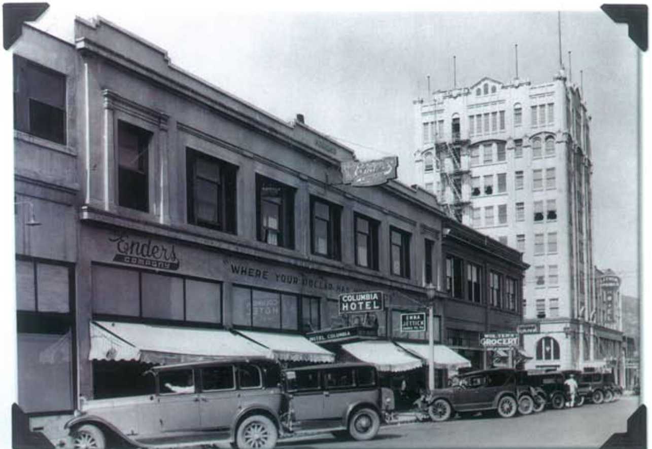
Ashland, East Main, Columbia Hotel and Ashland Springs Hotel in distance, late 1920's.