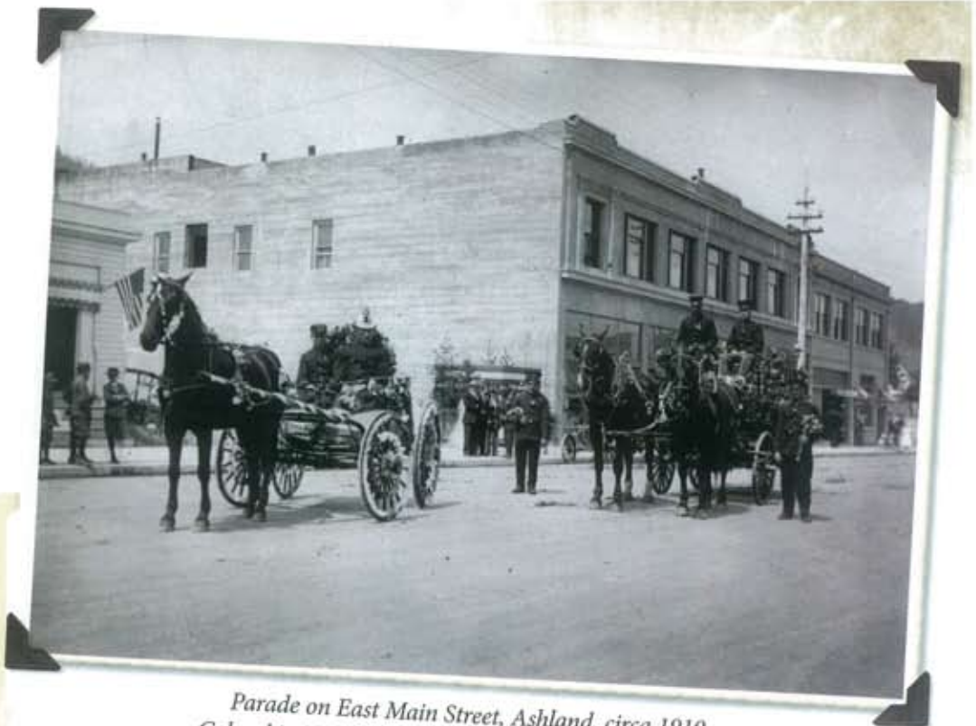
Parade on East Main Street, Ashland, circa 1910. Columbia Hotel in the background.