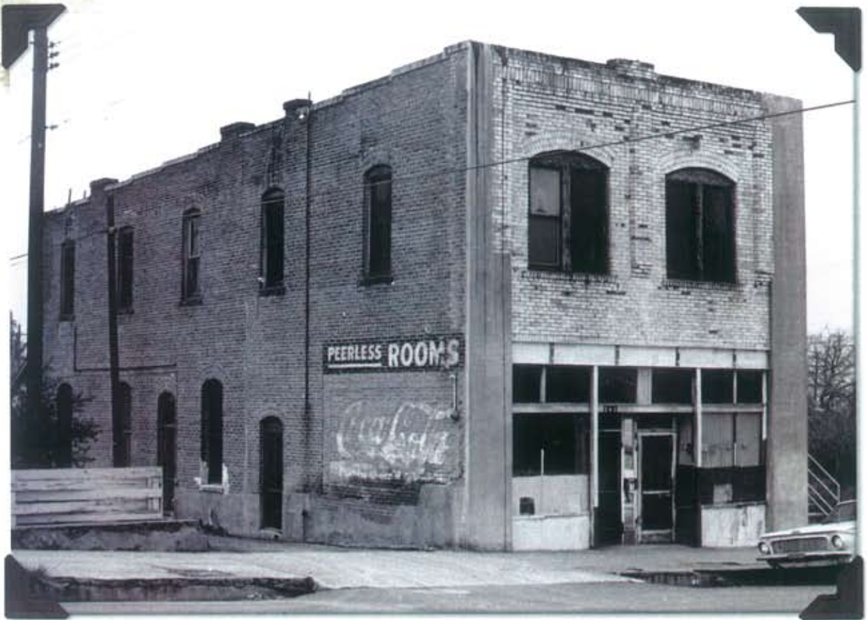
Peerless Hotel, 4th St. Ashland, circa 1970.