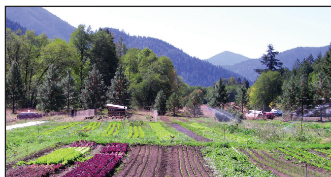
Barking Moon Farm in the Applegate Valley